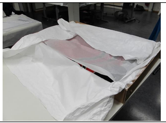
Fully cover object with tissue and Tyvek. If multiple objects in a box only same materials and heaviest on bottom (e.g. no metal with textiles)