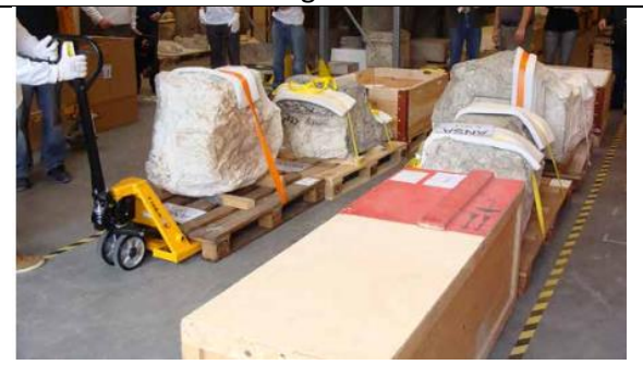
Always strap objects to a pallet for transport and leave on pallet for freezing