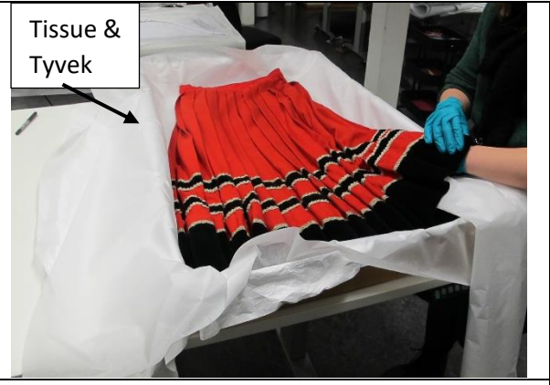
Pack object with tissue interleaving and support in a box that properly fits the object

Always wear gloves when handling objects, lift heavy objects from their base and never lift heavy objects alone.