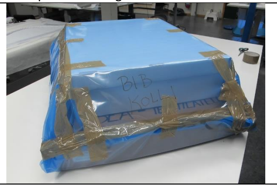
Use plenty of packing tape over all seams to seal, label with permanent marker on several sides