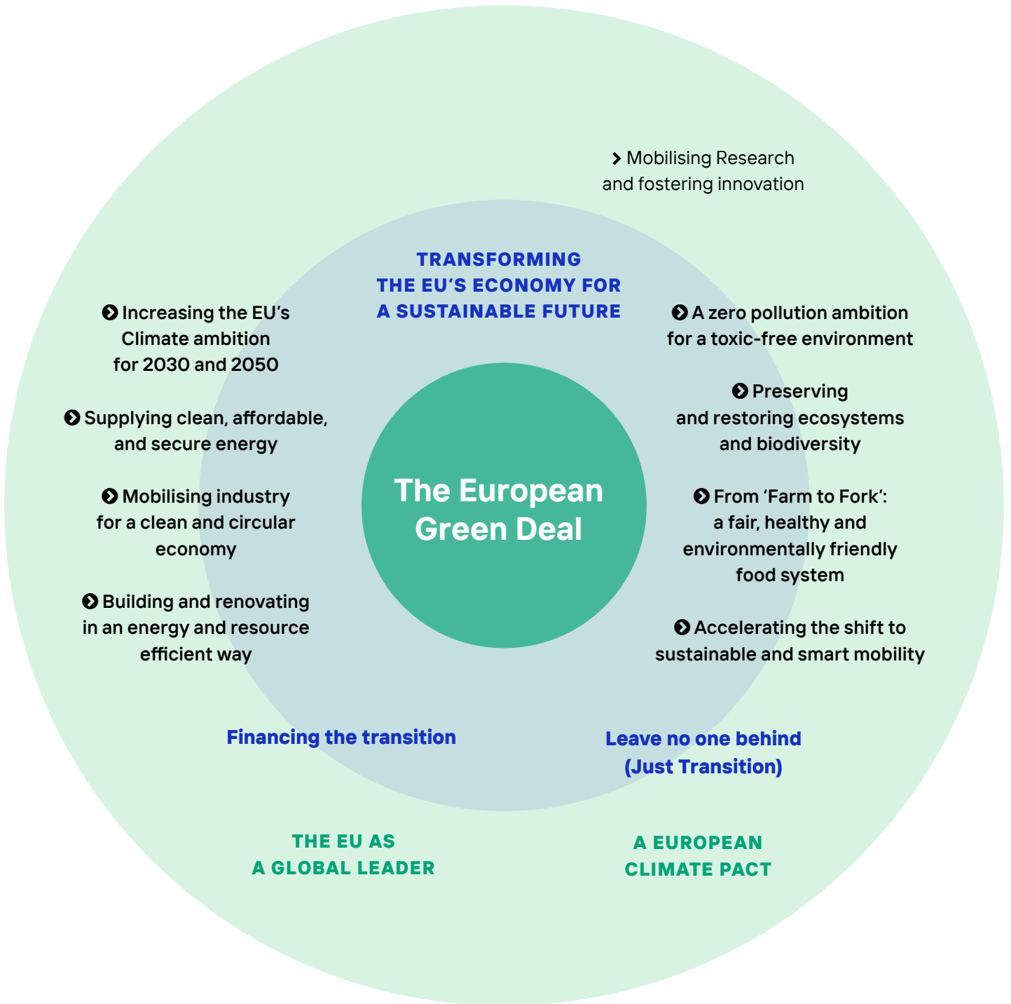
Figure 1: The European Green Deal.