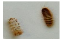
Carpet Beetle casing (L) and larvae (R)