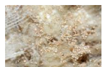
Frass and broken fiber