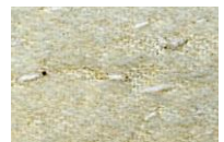
Moth casings & damage