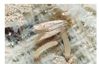
Casemaking clothes moth and larvae