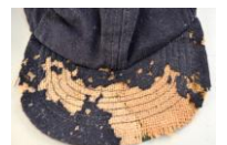
Damage from casemaking clothes moths