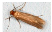
Webbing clothes moth