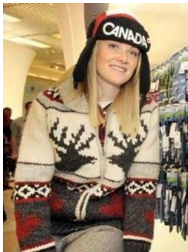
Figure 2: The Hudson's Bay Company sweater for the 2010 Olympics

HBC said it had considered using traditional Cowichan knitters to produce its sweaters, but “they were unable to meet Hudson's Bay Company requirements ... for consistency, speed to market and volume for delivery”. 3 The garment was instead made in China.