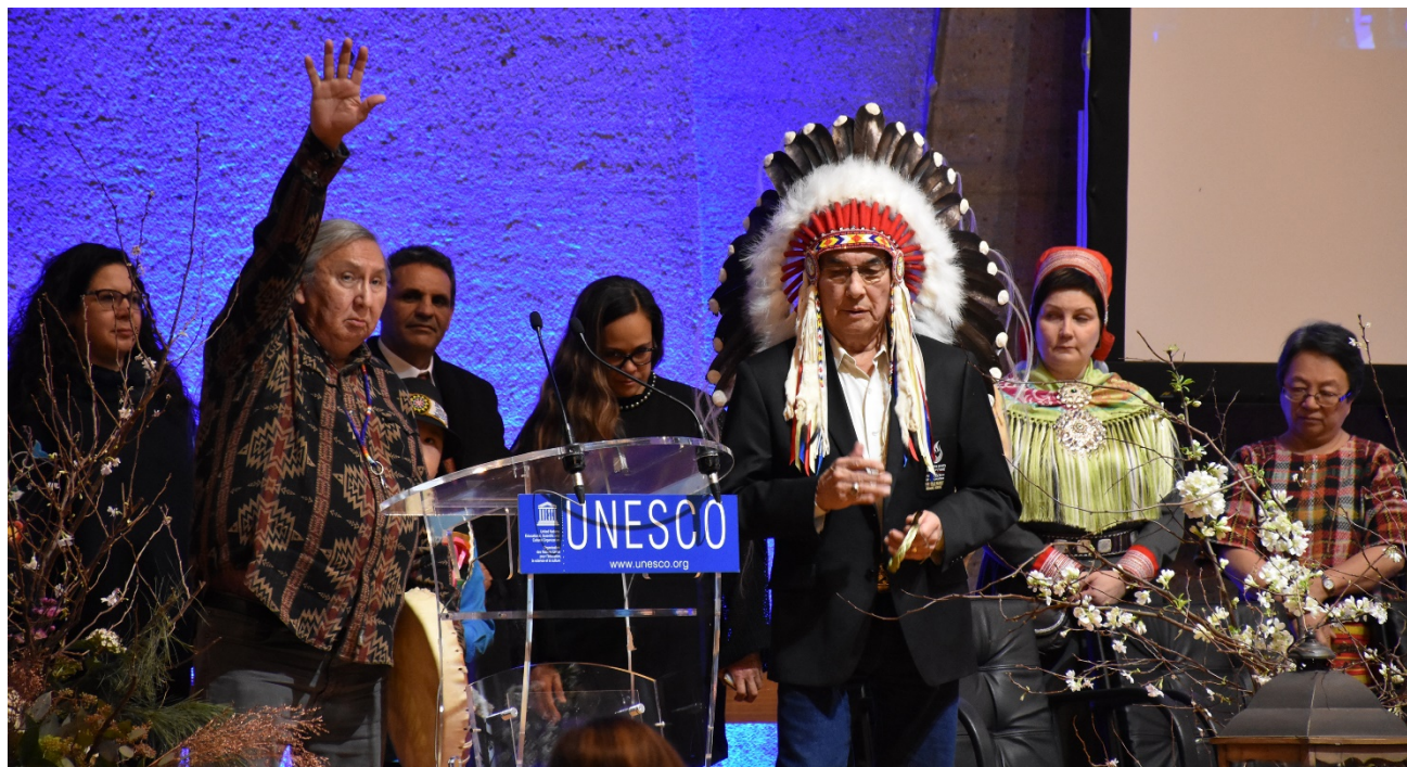
UNESCO: Spiritual opening performed by indigenous leaders at the official inauguration of the International Year of Indigenous Languages at the Unesco headquarters in Paris, January 2019.