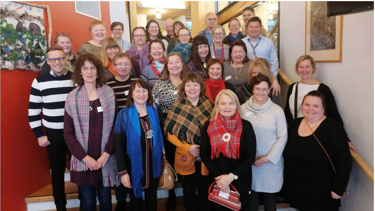
WORKSHOP: Group photo from the ICH workshop in Kárašjohka/Karasjok November 13th-15th 2019.

While the short duration of the workshop made it difficult to discuss issues in much depth, it contributed to the intensity and commitment of participants, whose busy schedules and long distances to travel might have made a five-day workshop impossible.