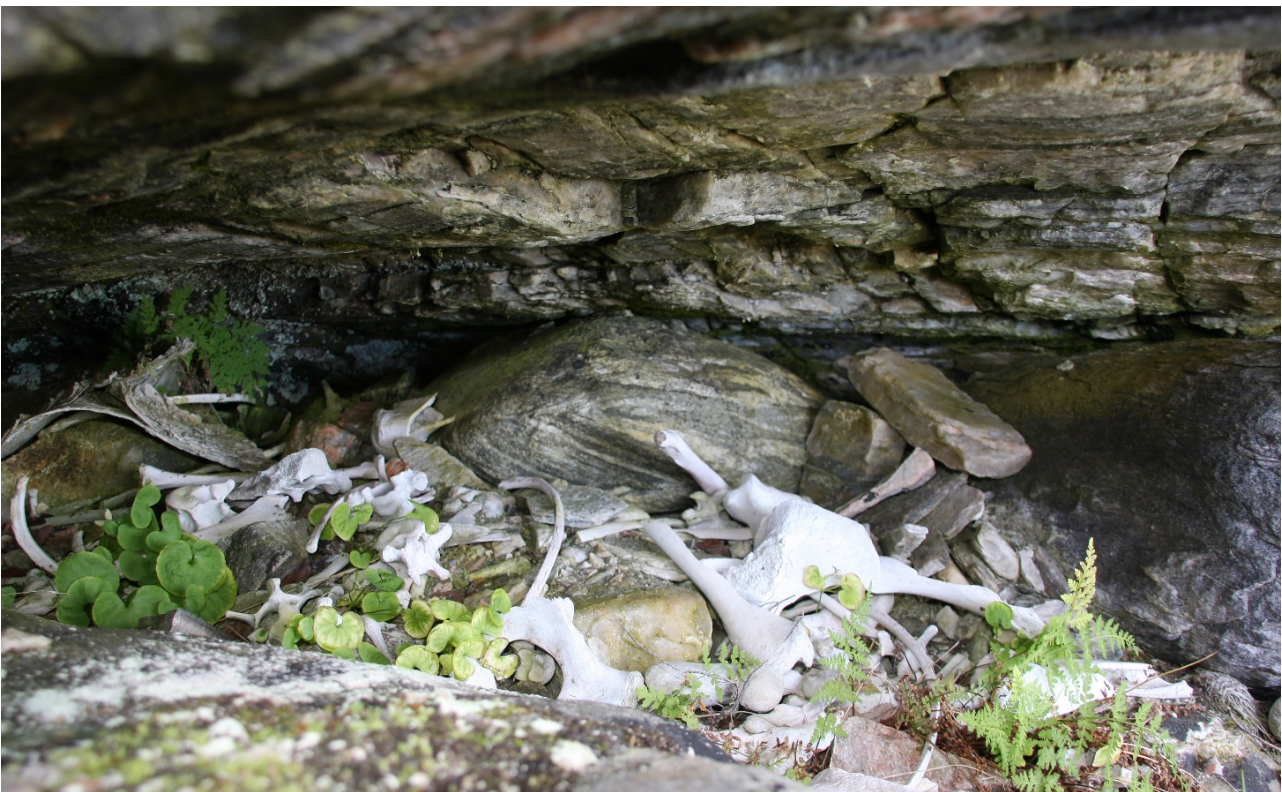
BEAR SKELETON: Traces of the ancient ritual of burying holy animals can still be found in Sami areas. This is a cave with a buried bear skeleton. Parts of the ritual is still practised today.

The definition of ICH in the Convention includes associated ‘instruments, objects, artefacts and cultural spaces. People may need instruments or objects to perform their ICH and some practices may yield material products. The enactment or the transmission of specific elements of ICH may be linked to specific places.